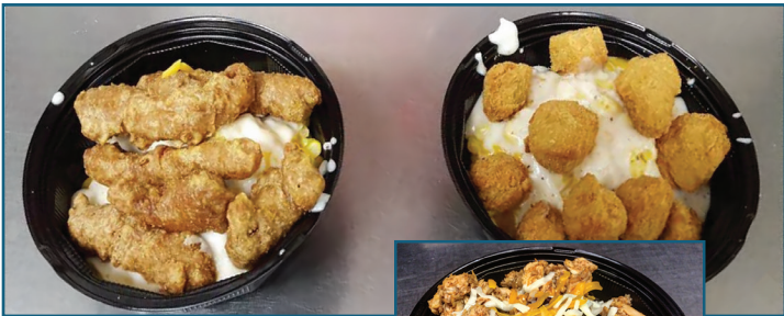
#24013 - 12 fl. oz. Invisi-Bowl® Mash Potato Bowls