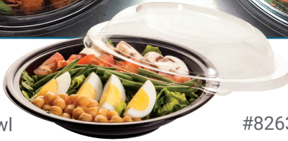
#82638 - Lid for Salad