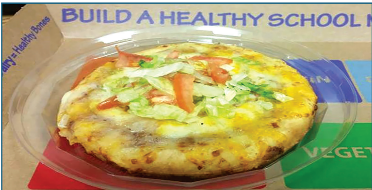
#24500 - Lid for 16 fl. oz. & 24 fl. oz. Invisi-Bowl® 5" Mexican Pizza