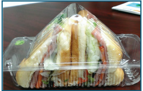
#21507 - Small Sand-Wedge®