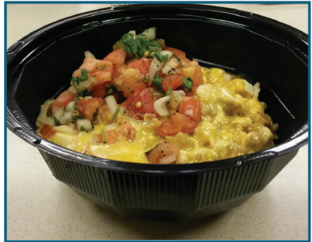
#24025 - 24 fl. oz. Invisi-Bowl® Chipotle Chicken Rice Bowl