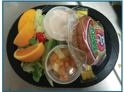
#21972 - One Compartment Oval Platter