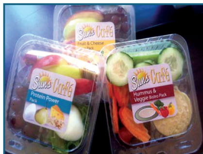
#82612 - 2 Pocket Clear Dipping Container