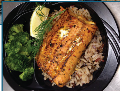
#21954 - Two Compartment Oval Platter