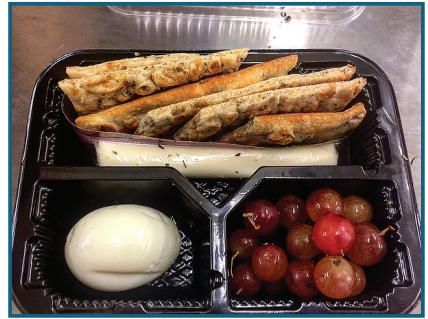
#21903 - Black Snack Tray