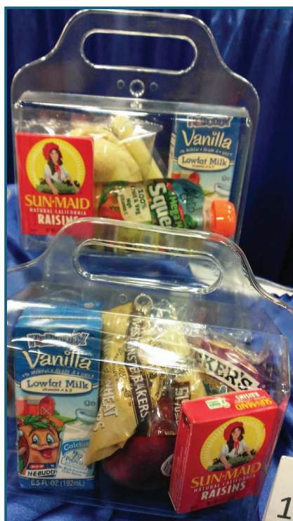
#21552 Lunch Box with Handle