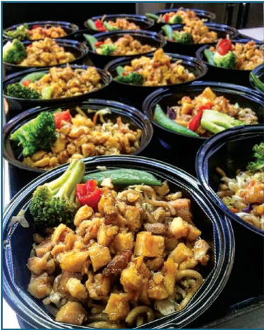
#24017 - 16 fl. oz. Invisi-Bowl® Spicy Noodle Bowl