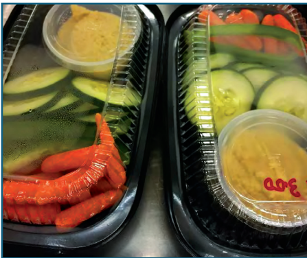
#21361 Medium Combo Platter