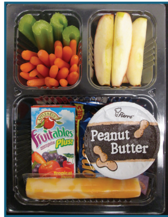
#82723 - Tray - Clear