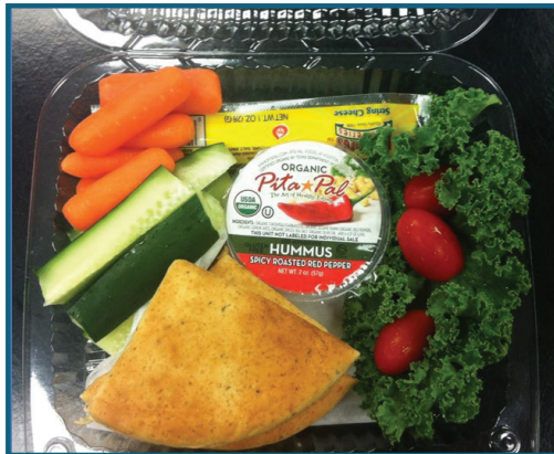
#29167 - Medium Shallow Clamshell Mediterranean Hummus Pack