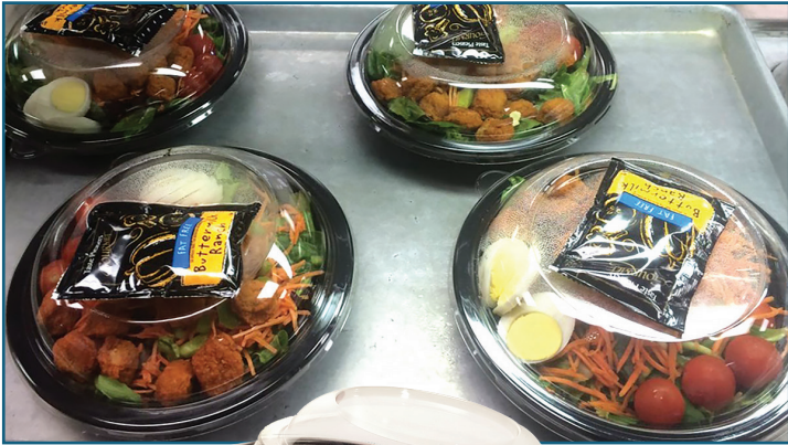
#82639 - 24 fl. oz. Salad Bowl