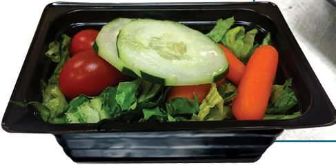
#21980 8 fl. oz.