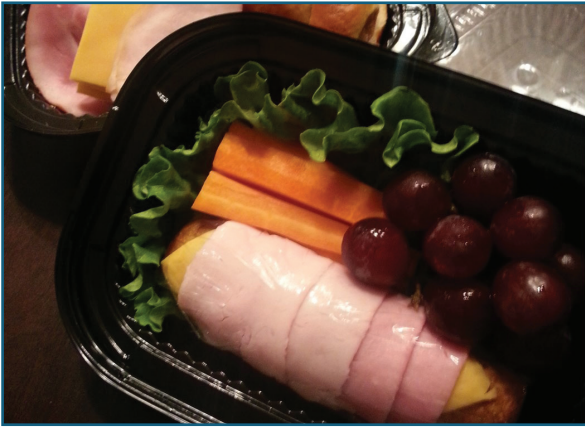
#21121 Small Combo Platter